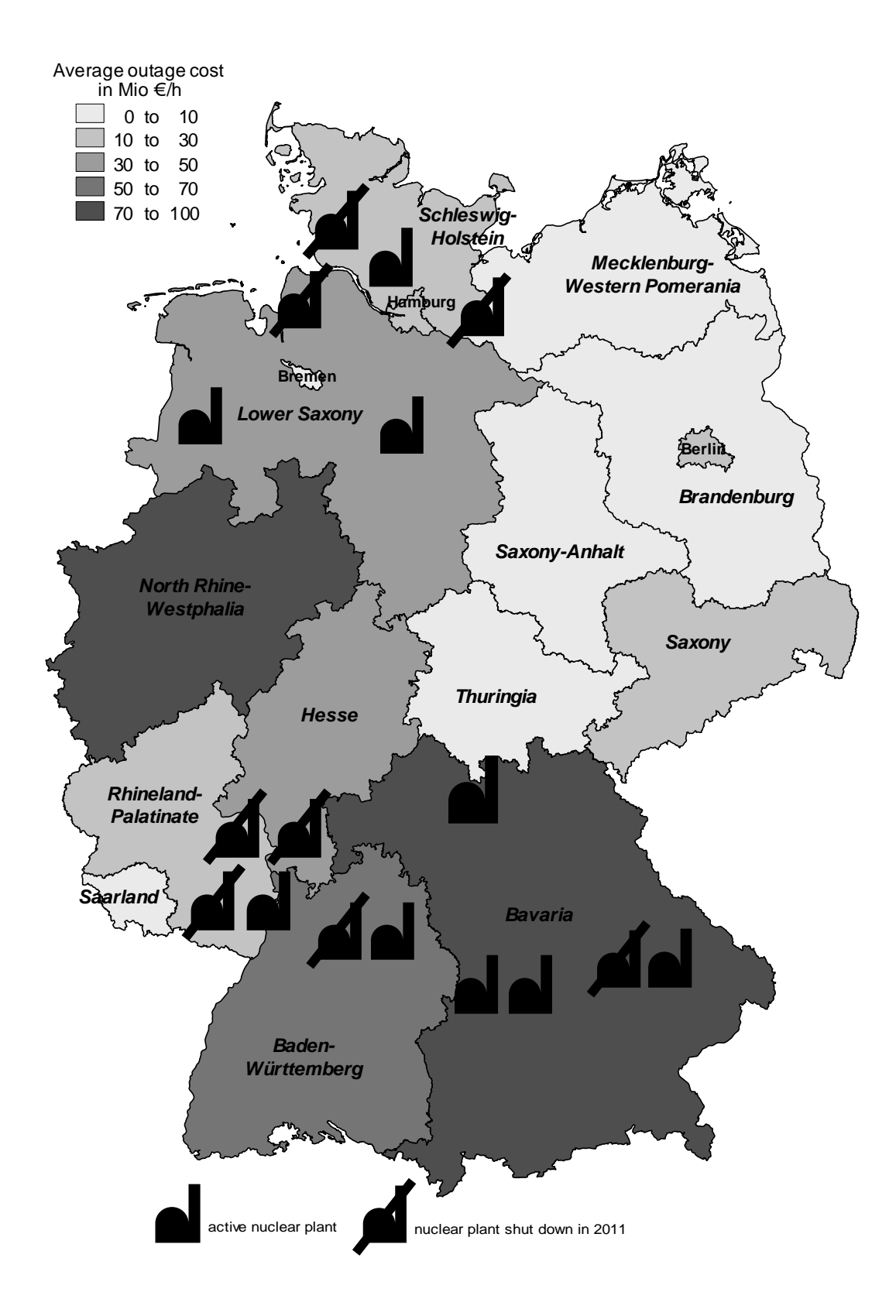
Figure 3: Average total outage cost on the federal state level in Mio€ per hour